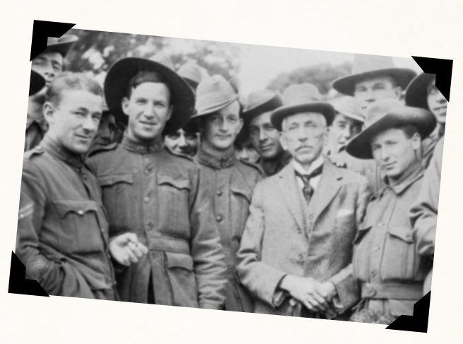
Australian Prime Minister William Billy Hughes with Australian WWI troops.

At the end of the war, meetings were held between world leaders to decide how to keep peace and recover. The American president thought that the Australian Prime Minister should not have a presence in these meetings. Why do you think the opinions of Australia changed after World War I?